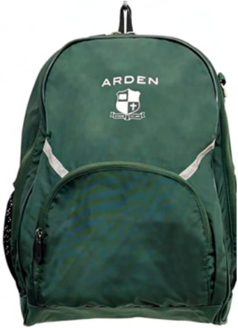
Pre-School - Year 2